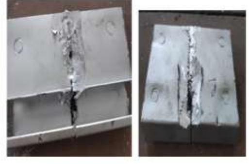
Hardness test of welded material (He9)

As shown in the pictures, FSSTSW technique is works to joint the similar material, lightweight aluminum plates in very less time without any error. And less skill required to perform the experiment, this can be good advantage of the welding techniques.