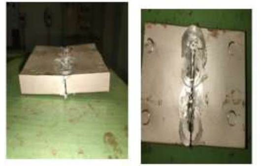
Hardness test of Tool (En31)